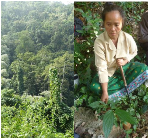
Indigenous knowledge being protected and preserved

A very special success for our Vietnamese partners: At the end of 2017, the Vietnamese government recognized the land rights of Indigenous minorities in their so-called holy ancestral forests.