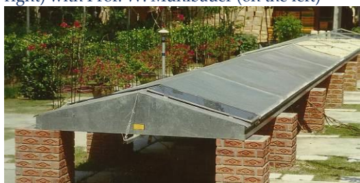
Solar dryer for herbs at the Chitralada-Palace