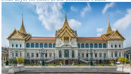
Grand Palace in Thailand Bangkok