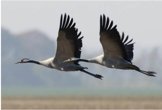
Cranes on their Eurasian-African migration