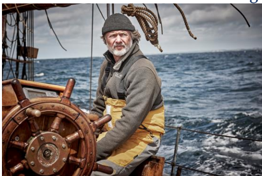
Polar explorer, adventurer and author Arved Fuchs