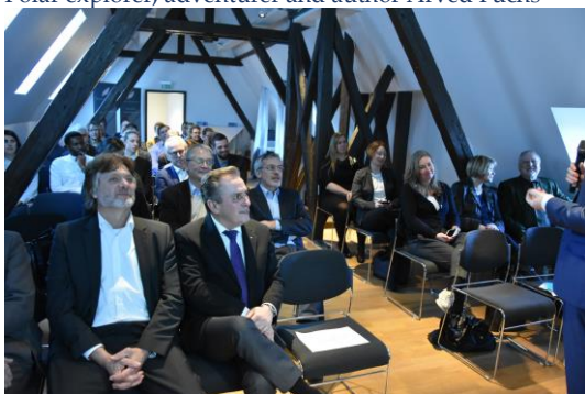
The Award ceremony in the Press Club of Frankfurt