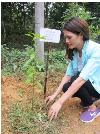
Planting trees for the future