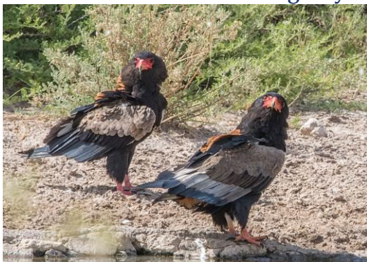
Bateleur – a bird of prey. This bird is the symbol for help from the air. For both endangered animals and their habitats in Africa.

Whether turtles that are ready for their release from the breeding grounds, or wild dogs that are brought to safe habitats as well as recovered lions that are brought back to nature: they all benefit of the dedication of "the Bateleurs". The organization "The Bateleurs - Flying for the Environment in Africa" has the bird of prey named the Bateleur as their symbol. They coordinate the owners of small aircraft, pilots and other volunteers for animal emergencies, as well as for irreplaceable wildlife counts and the control of the last natural paradises. Numerous successful flights can be organized every year that help the threatened nature and the endangered species. NatureLife is supporting this significant work of the Bateleurs and their president Sven Kreher.