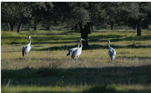
Cranes in the Spanish Extremadura