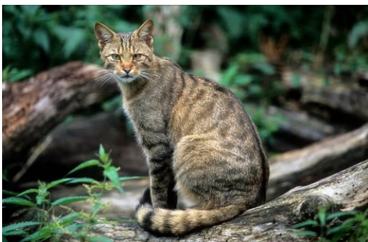
Animal of the year: the wild cat

NatureLife is not only committed to its own homeland - for example the Black Forest National Park and various nature parks around Germany - but also to regions of Europe, Africa and Southeast Asia. The animal of the year - the wildcat - is extremely symbolic especially for the European wild forests. On the one hand, this shy wild animal needs suitable habitats that are simply incompatible with intensive forest management and on the other hand it needs migration corridors, so that a gene exchange can take place between the populations. The German Wild Animal Foundation has declared the wildcat as the wild animal of the Year 2018. NatureLife helps to maintain such habitats, migration corridors and herding trails.